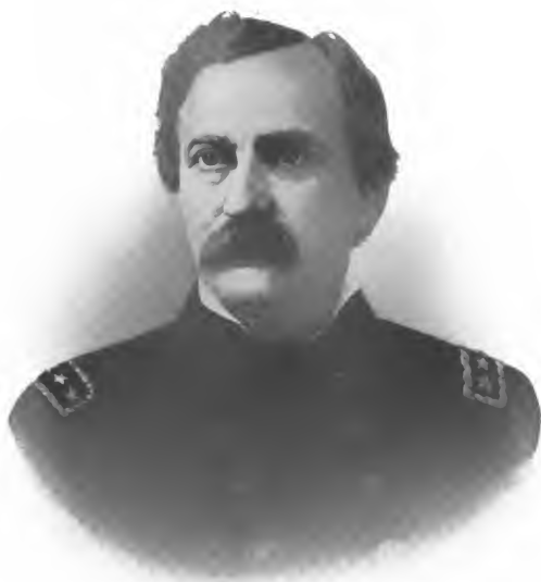
WILLIAM H. PARKER